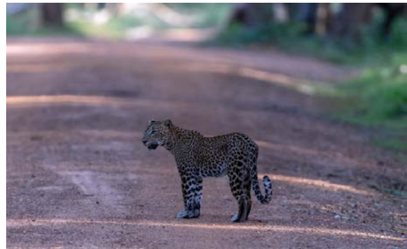
Figure. 1b. A leopard crossing the deserted main vehicle track at Wilpattu National park, Sri Lanka, during the Covid-19 lockdown.