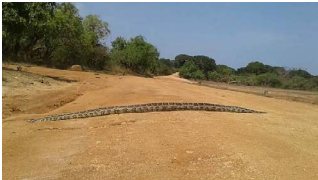
Figure. 1a. A python crossing the deserted main vehicle track at Yala National Park, Sri Lanka, during the Covid-19 lockdown.